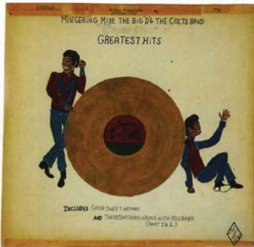
Mingering Mike, Mingering Mike, The Big 'D' & the Colts Band - "Super Gold" Greatest Hits , (Ming'War Production), 1970. Fictive LP cover, mixed media on cardboard, 12 x 12 inches. Image courtesy of Mingering Mike, Inc. and Memphis Fine Arts, Washington, D.C.