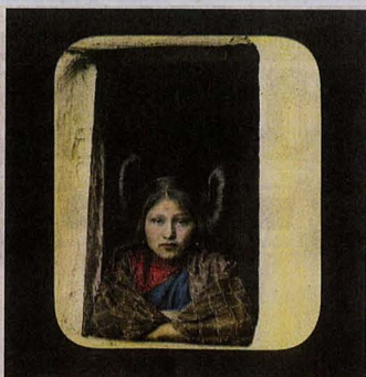
SOUTHWEST An image by Sumner W. Matteson from "Ancestors and Descendants," at the New Orleans Museum of Art.