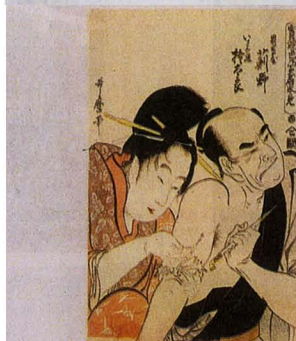
TATTOOS A woodblock print from "Edo Ink," the Museum of Fine Arts, Boston.