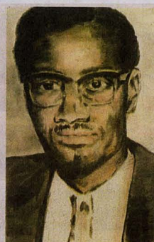
RETROSPECTIVE "Lumumba," by Luc Tuymans, at the Dallas Museum of Art.